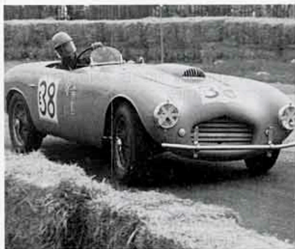
MARION LOWE CORNERING

Yes, the women are taking to the road racing circuits with gusto. So, aside from the Ladies' Race on Sunday, don't be surprised to see a dainty, feminine form in the cockpit of a car charging through the turns during the six hour grind.